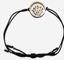
Innoceana coral bracelet